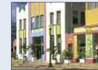
Art Deco Architecture

The self-styled "Conch Republic" is our southernmost tropical city with the best diving, snorkeling, and fishing the continental U.S. has to offer. This 3x5-mile paradise boasts a laid-back attitude, spectacular sunsets viewed from Mallory Square, and a long list of illustrious residents, which have included Ernest Hemingway, Harry Truman, Thomas Edison, and Jimmy Buffett. Take a stroll along Duval Street, from the Atlantic Ocean to the Gulf of Mexico, or explore its interesting art galleries and boutiques.