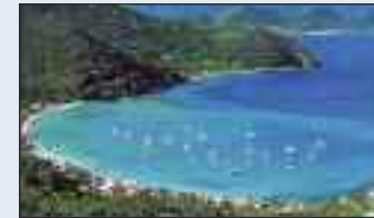
Turks and Caicos Beach

This island has some of the best diving and snorkeling anywhere, courtesy of one of the world's largest networks of coral reefs, easily accessible off the island's shores. One reef, aptly called the Wall, is particularly spectacular; it drops 7,000 feet straight down! Between the shore and the reef, the water is only waist deep, providing a perfect place for beginning snorkelers to get their feet wet. The six-mile long island is home to teeming sea life and beautifully pure beaches and coves—truly a wonderful place to explore.