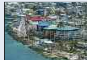
Aerial view of Georgetown

A glorious day at sea gives you plenty of time to enjoy the ship's luxurious amenities and relax in between conference events. After seminars are over, soak in the sunshine by the pool, join an aerobics class, or indulge yourself with a massage.