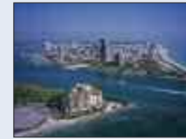
City of Miami

The city is one of the most cosmopolitan places in the world. People have always been attracted to the city for its weather, vibrant lifestyle, and unique, high-velocity energy. Miami is a center of entertainment amidst sunshine, majestic palm trees, and sandy beaches.