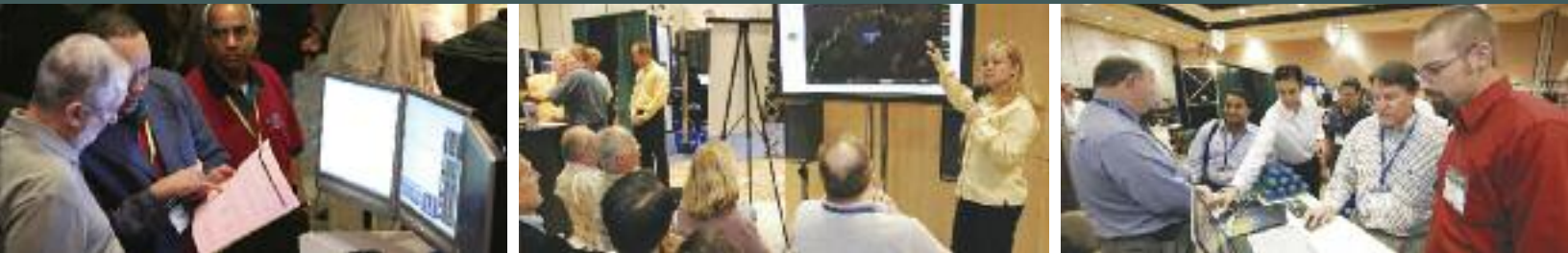
Exhibit and Showcase Your Company to 6,000+ Active Traders!